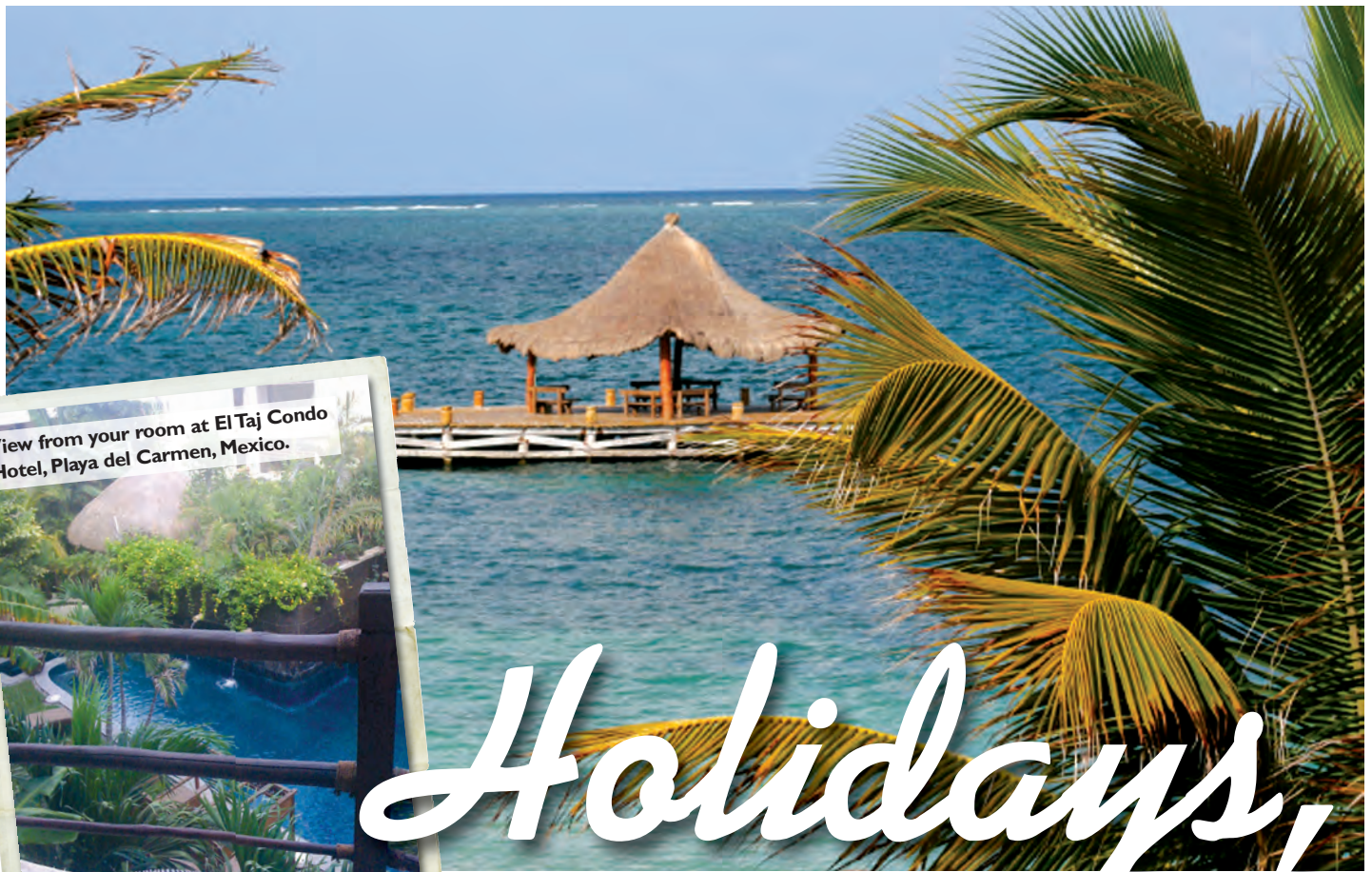
View from your room at El Taj Condo Hotel, Playa del Carmen, Mexico.